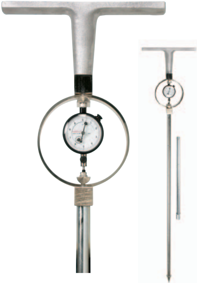
Proving Ring Penetrometer