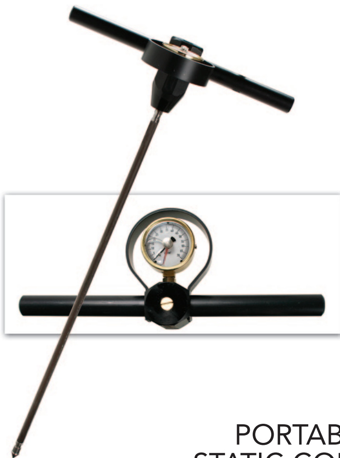
PORTABLE STATIC CONE PENETROMETER