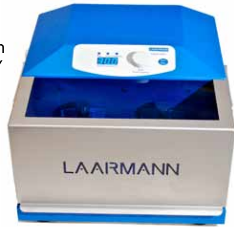
Lab Wizz with closed "EASY COVER"