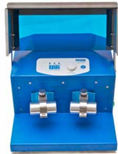
Lab Wizz with open "EASY COVER"